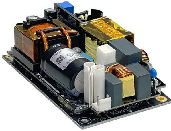
Figure 4: The GaN based technology MEP-600A supports up to 600 W output power in a wide operating temperature range

The GaN based technology MEP-600A offers high power density in a 3" x 5" footprint. It supports up to 600 W output power in a wide operating temperature ranging from -20°C to +80°C. With 5V/2A standby power and electric shock protection (complying with 2 x MOPP) it ensures protection against electrical shock even in patient-contact applications. The MEP-600A offers reliable power supply for type BF medical equipment (body floating, a classification for medical equipment that has electrical contact with a patient, but not near the heart).